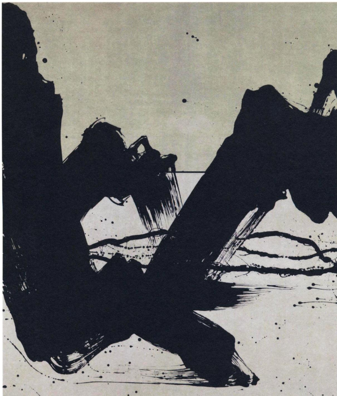
Memories of Norway #1, 2012 | Pigments and ink on canvas | 211 x 180 cm