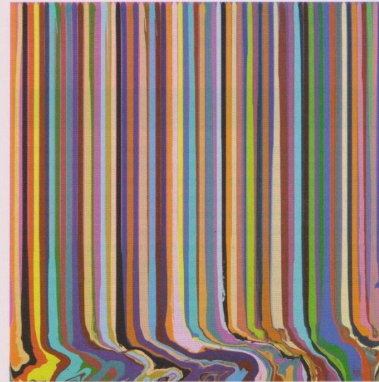
Ian DAVENPORT (Born in 1966), Puddle Painting: Magenta, Green, Violet, Green, 2011 Acrylic on aluminium, mounted on aluminium panel, 200 x 200 cm, Diptych

As the most prominent contemporary of post-painterly abstraction, Ian Davenport has injected new life to the practice of painting. The artist consistently creates complex colour arrangements in vertical lines of varying widths. Starting out to only have had experimented with monochromatic or subtle hues, he expanded his repertoire and proceeded to work with bright, vibrant tones from animated sitcoms in popular culture – such as The Simpsons . His works are formal and calculated, but also vulnerable to unassailable forces of gravity and chance. Seeking inspiration from Italian frescoes, cars, street signs, and Flamenco, Davenport works by pouring gloss paint from heavy-duty syringes spaced along the top of the working surface, and then tilting it, or simply allowing the paint to overflow and ooze into concentric puddles. Borne out