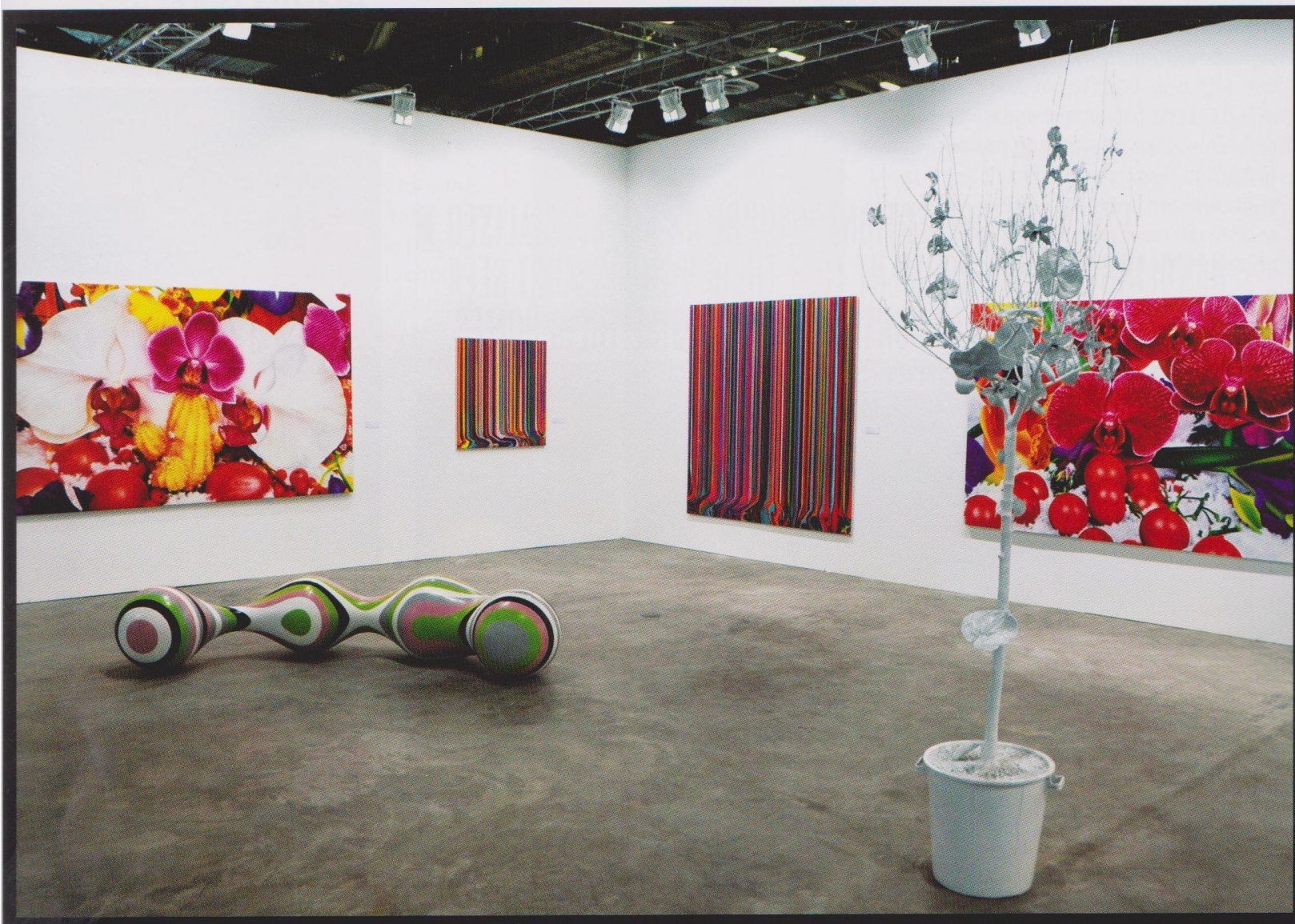
ART PLURAL GALLERY, 38 ARMENIAN STREET (S) 179942, TEL (65) 6636 8360, WWW.ARTPLURALGALLERY.COM