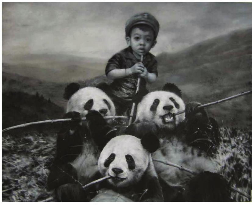
Fabienne Verdier, L'un, 2012